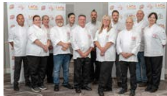
SCOTY 2024 finalists