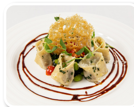
Holly's winning main course - Braised Beef Tortellini on a bed of soya bean and spinach, a tomato and basil sauce, balsamic reduction and a parmesan crisp