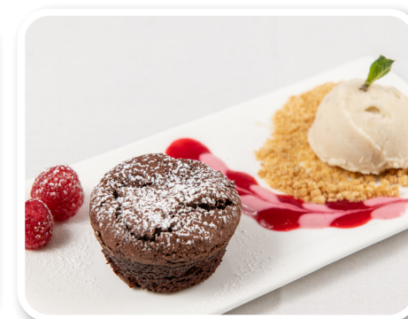
Holly's winning dessert - Chocolate and beetroot brownie served with banana ice cream, crumble and a raspberry and vanilla coulis