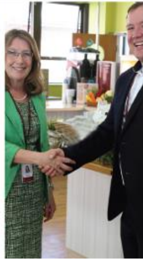
Building long term partnerships