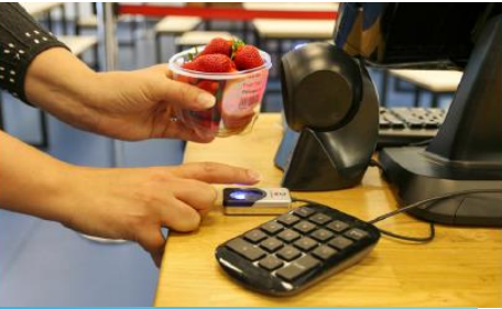
Digital tools to enhance student experience